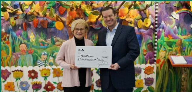
Grantee : Childserve