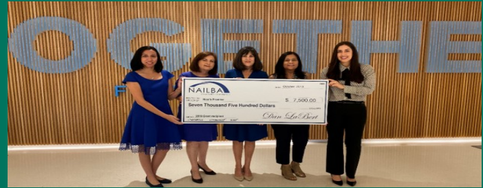
Grantee : Nico's Promise